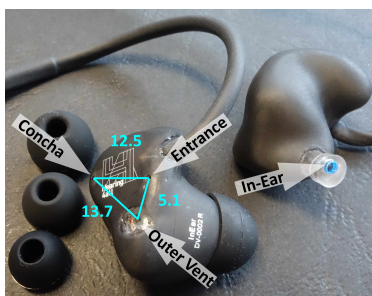
Figure 1: Image of earpieces, including distances between microphones (centres of ports) and assigned microphone names.

Each unit includes one pair of earpieces, and 16 silicone domes in 4 sizes. The device is functional with other domes, but for comparability we recommend to use the ones supplied. Additional earplugs can be ordered at InEar, Germany. Replacement Cerumen Filters (type HF4) are not included, but can be reordered.